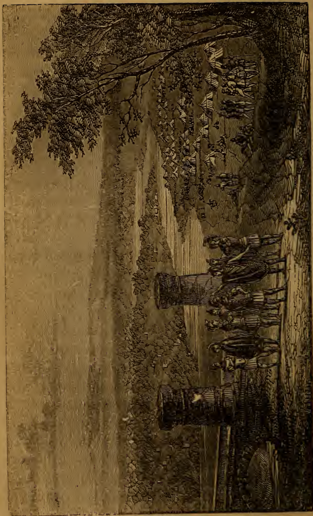
CROSSING THE RUBICON.